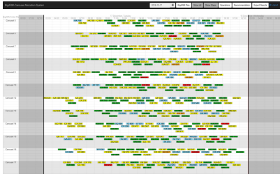
Fig. 2. Initial plan generation. (Color figure online)

flight represents the baggage load from the lightest (green) to the heaviest (red). Besides reducing the time of generating the initial plan from hours to seconds, BigARM's initial plan achieves 36.61% more balanced than the one made by experienced operators in the airport.