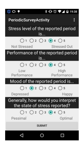
Figure 2: An Example of Periodic Survey.

sensor. These data can be categorized into heart rate, usage, and survey measure respectively.