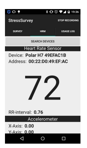
Figure 1: Control Panel for Heart Rate Measurement.